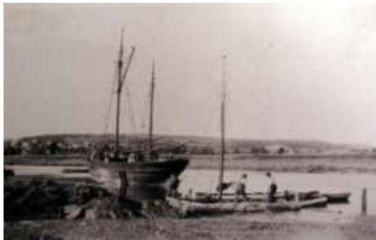
Ships at Velator Quay in Braunton