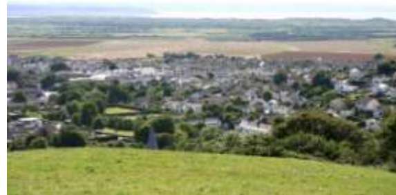
The view over Braunton Great Field