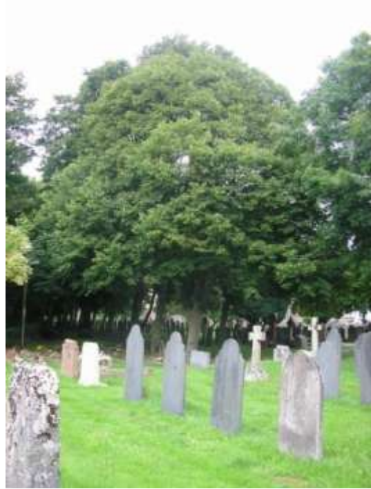
The Peace Tree