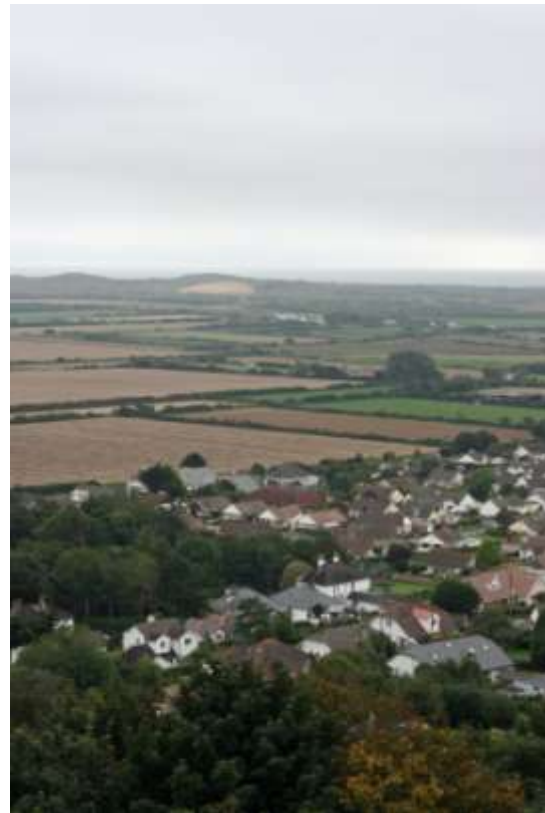
Towards Braunton Burrows