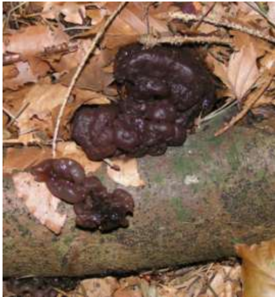
'Witches butter' fungus