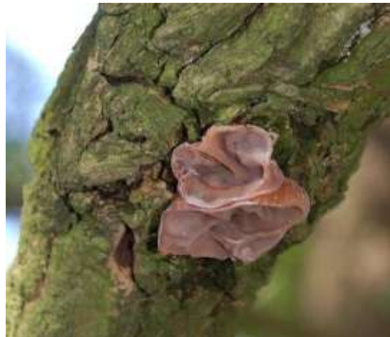
'Jew's ear' fungus

The path now levels off and enters an area thick with primroses in the spring. Please remember to follow the path to help preserve these lovely plants. Other species seen in the season are a wide variety of ferns including harts tongue, ground ivy, early purple orchid, dogs mercury and wood sage.