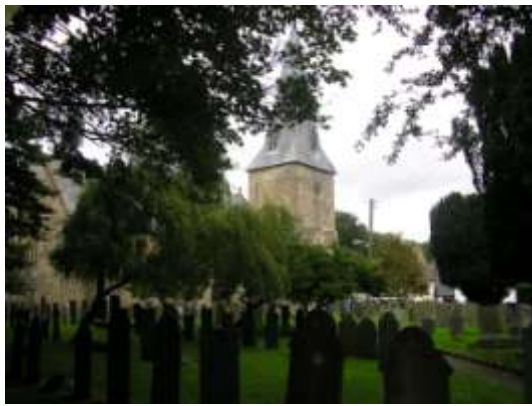
St Brannocks church

pass of Chaloner's Road opened in 1924. Continuing through East Street, we pass by Broadgate. This was once the manor house of Braunton Gorges, one of the four Braunton Manors. Continuing along the street there is now little evidence of the series of burgage plots formerly found here, except perhaps for one farmhouse sitting uneasily between the Agricultural Inn and the Chapel.