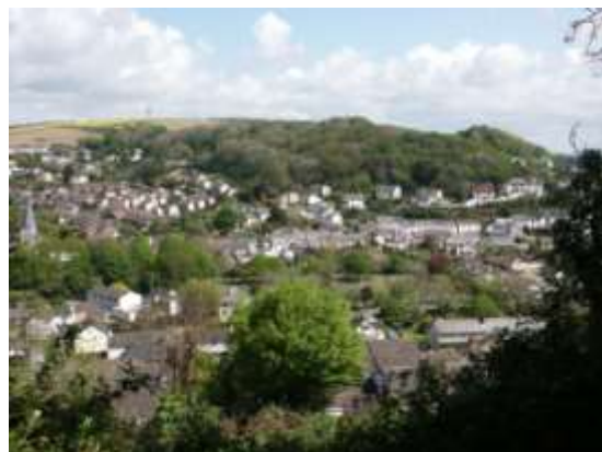
View over the village from the Beacon

To complete the walk, retrace the route down the sunken lane and Rock Hill and at the bottom of Rock Hill follow the lane to the left. Shortly after, make a sharp turn to the right down a narrow public footpath. At the bottom of this you will emerge onto the track bed of the disused Barnstaple to Ilfracombe railway line, now part of National Cycleway 31. Here you may either turn right to follow the path back to the car park or continue straight ahead, carefully cross the main road and head towards the parish church. Once safely across the main road, bear left and cross a small bridge, to enter the church yard.