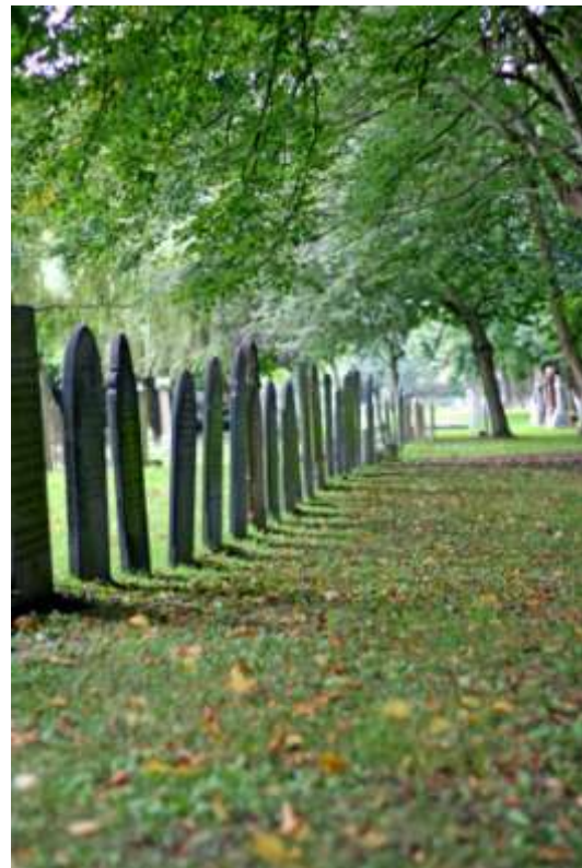
Gravestones in the church yard