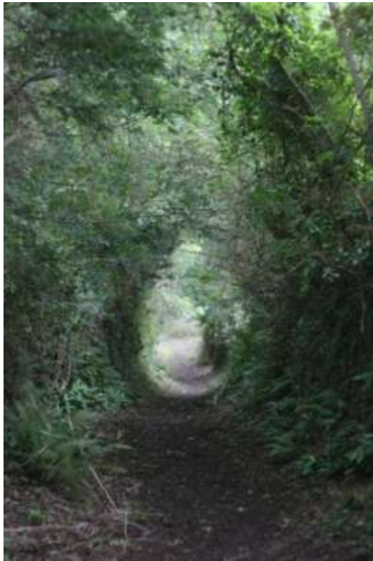
The sunken path