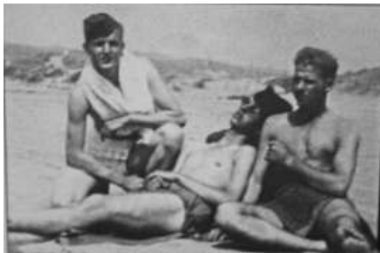
Troops relaxing on the beach

The path leads gently downhill until it comes to the edge of the Beacon area and then swings uphill via a series of steps. These lead to the stone information cairn and viewpoint.