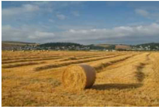
Braunton Great Field