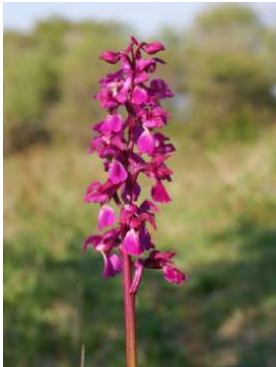
Early purple orchid