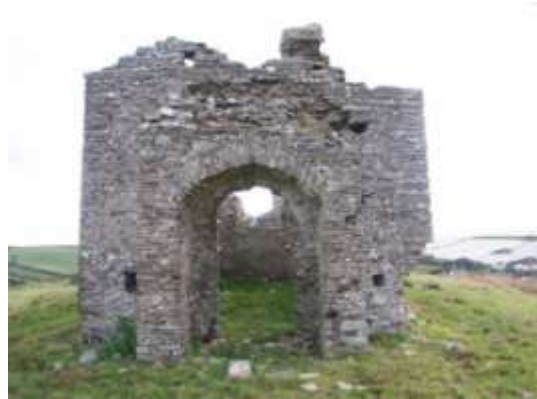
St Michael's Chapel