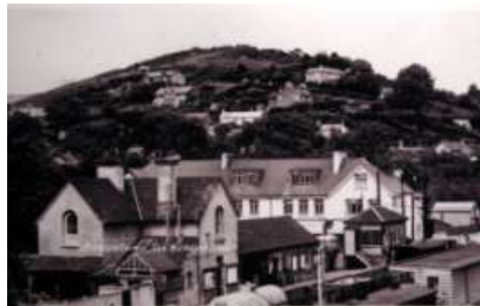
The Stationmaster's house when the station was laid out before it, with the Beacon behind. Notice the lack of trees on top.